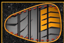
macro-block technology - Standard footprint - Footprint with macro-block technology