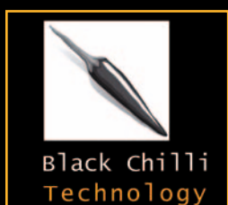
Black Chilli Technology

The macro-block design of the tyre's outside shoulder provides a larger contact area, which can therefore adapt optimally to the road surface. The ContiSportContact™ 5 offers improved road grip and thus more safety when cornering.